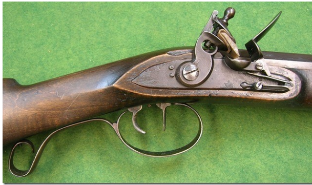
(Above: Rendition of the Ashley Hawken)